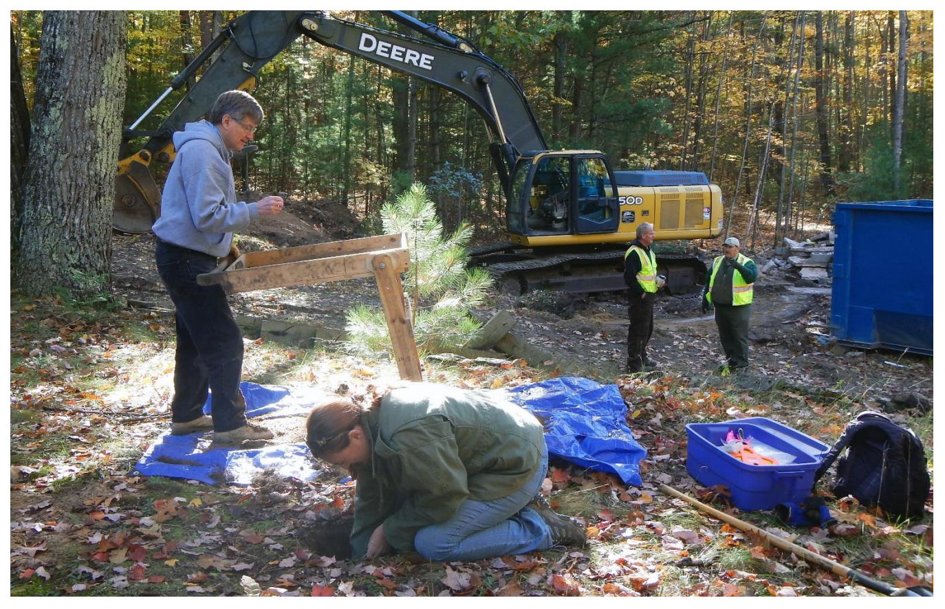
Investigation by State Archaeologist and Graduate Student Assistant, the Johnson Site (20CH46), Mullett Township, Cheboygan County.

The position of State Archaeologist existed in state government from 1972 to 2019. The State Archaeologist—and the Office of the State Archaeologist—was dedicated to the preservation and protection of 14,000 years of human history on state land by: