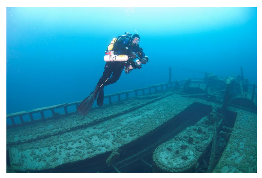
DNR Maritime Archaeologist on the Grecian shipwreck (20UH46), Lake Huron.

The cost to fund the Office of the State Archaeologist, including staffing and space rental to DTMB, will be just under one million dollars.